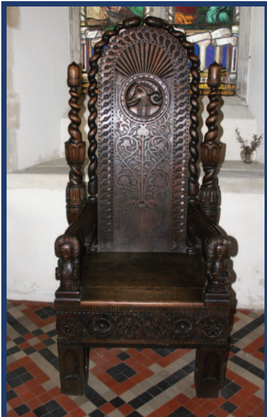
One of the remarkable chairs