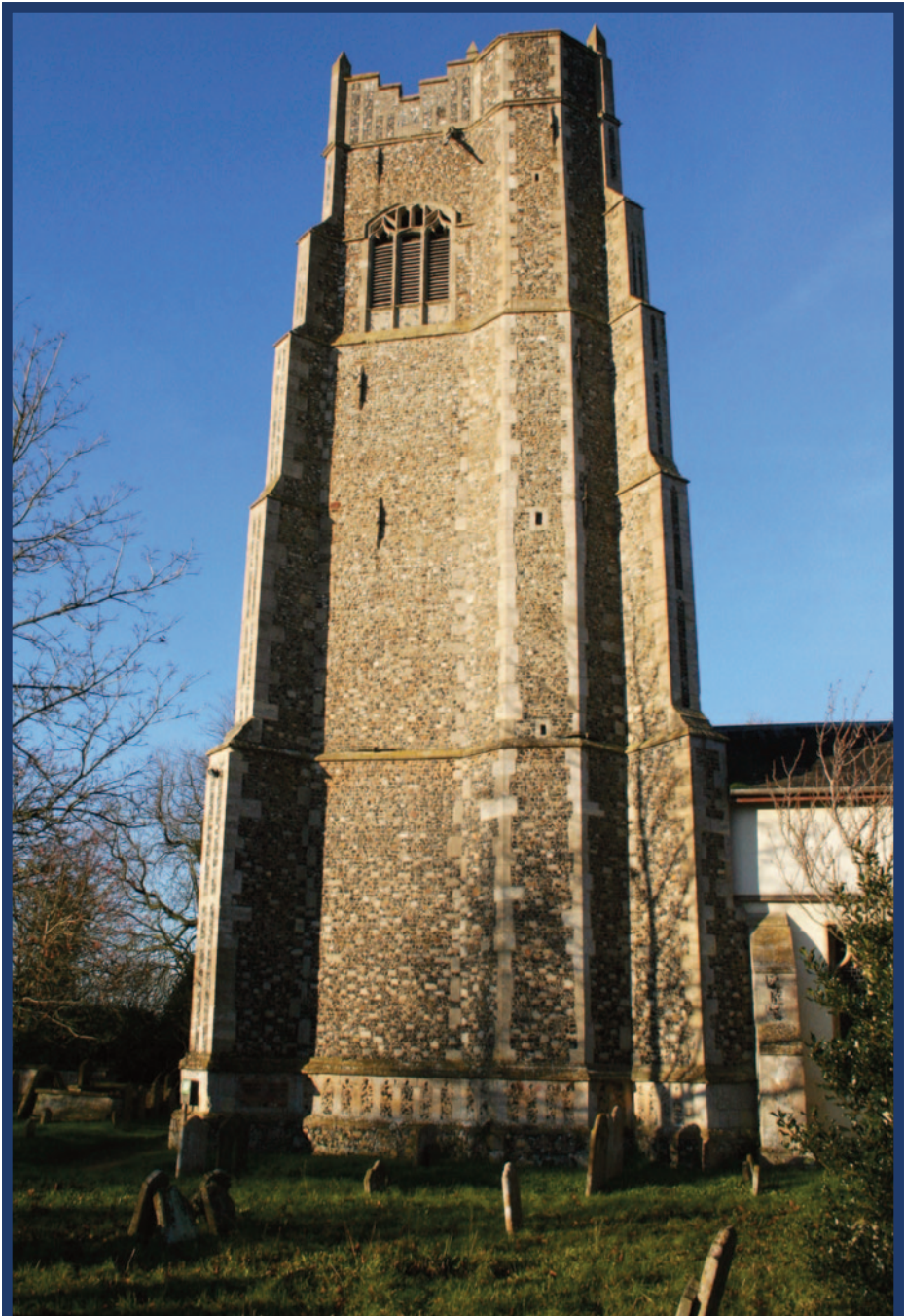
St. Mary's Tower