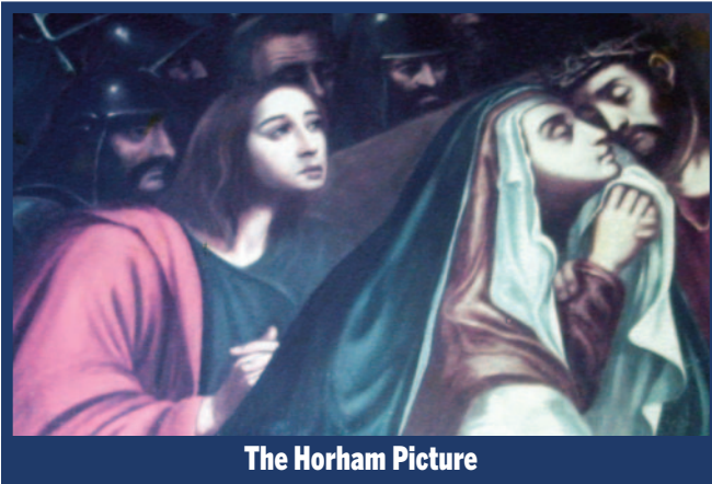
The Horham Picture