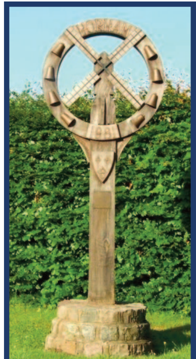
The village sign

Nearby is the marble memorial (1981) to the 95th Bombardment Group, of the U. S. Air Force who served in World War II from Horham Airfield. A short distance along the