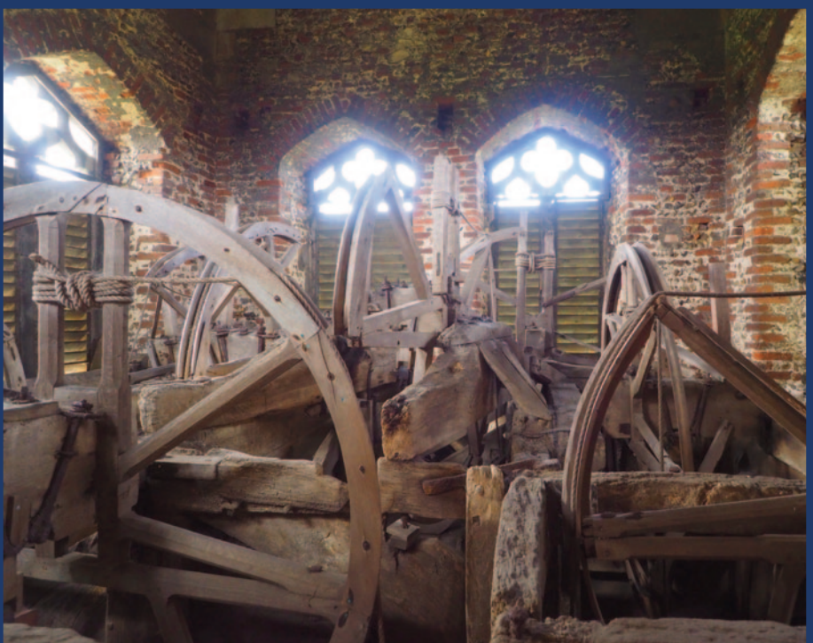
The bells in their old wooden frame (above) and in their new frame (below).