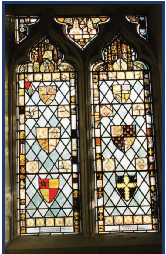
The Mediaeval Glass

Nave, north-east. Here all the fragments of 14th and 15th century glass have been carefully assembled in 1963 by G. King & Son of Norwich, as a memorial to the Rev’d C.E. Emerson who spent his last years in retirement here. This window incorporates six shields, mostly made up of jumbled fragments, but some of the arms are identifiable. Look for:- a) Eastern light - 1. The Arms of England and France (Edward III, reigned 1327-77), 2. The Arms of England and France, with fleur de lys (the Black Prince, Edward’s son). 3. The mullet (star) of the De