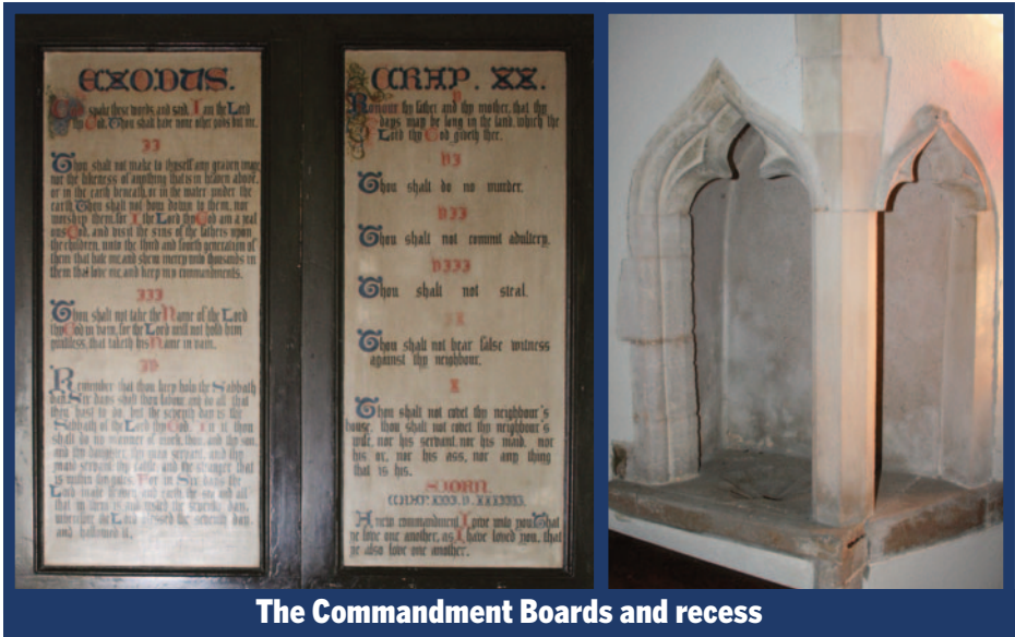
The Commandment Boards and recess

the emblem of the Trinity from one of the others. The font is crowned by a beautiful cover – a graceful curved spire, with ribs embellished with crockets, rising to a central finial with a little ring at its very apex, showing that at one time the cover was hoisted. This work, and the skeleton of the font-cover, dates from the 15th century - notice the holes in the bottom through which the pre-Reformation locking devices fitted. The acorns round the edge at the bottom are later additions (some are very recent replacements) and it is clear that the cover has been greatly restored. Maybe Augustus Frere, who restored Worlingworth's magnificent font cover in the early 1890's also worked on this one.