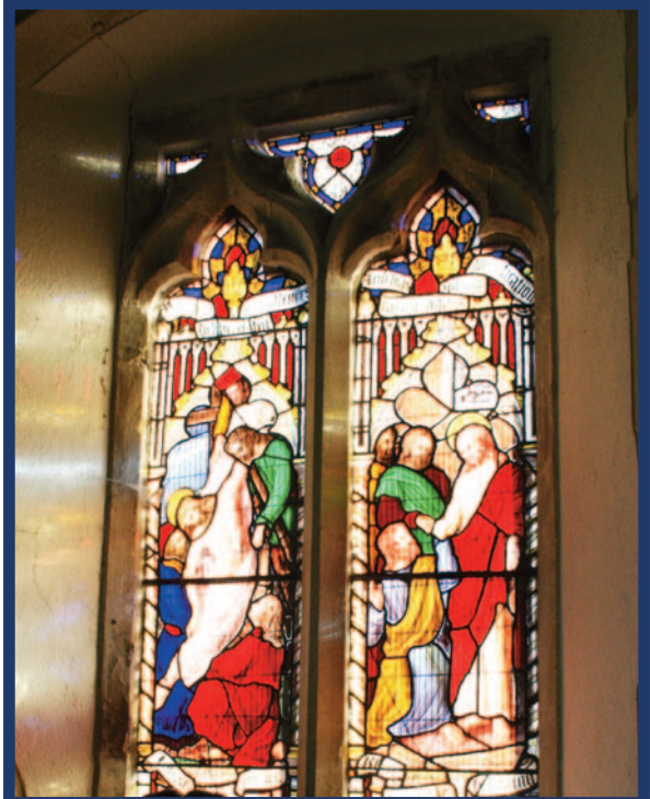
One of the square topped windows

much of the nave fabric is also of this date. It is clear that the nave was heightened at some later stage, probably in the late 14th or early 15th centuries , when the present double square-headed windows were inserted, maybe replacing the tiny slit-windows which the Normans would have put here, thus giving more light, also scope for artists in stained glass. Maybe some of this work was paid for by the Jernegans (or Jerningham) Family, who held the most important of Horham's six manors from the time of the Domesday for several centuries. Another manor was held for a period by the Uffords, who were great church builders. The arms of the Jernegans were carved on the font when D. E. Davy visited the church in 1809, so doubtless they helped to pay for its erection in the 15th century. Also in the 15th century the nave received a set of benches, and the ends of some of these may still be seen here.