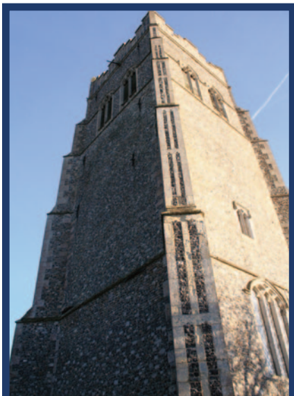
The fine western tower and pulpit