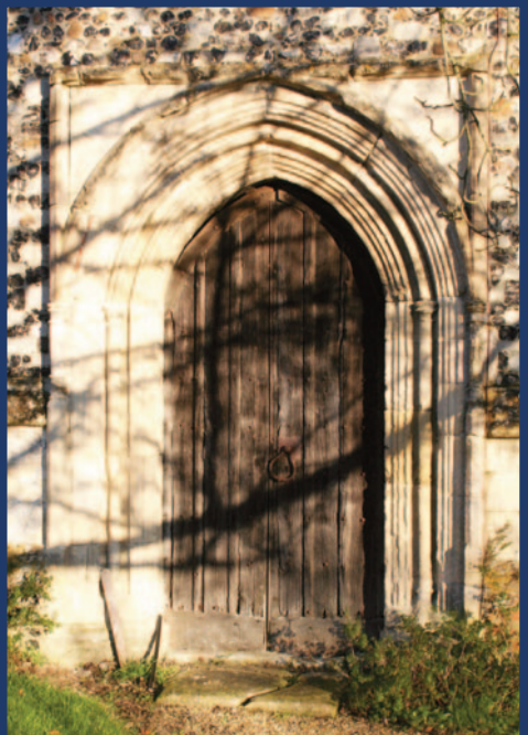
St Mary's font and a Norman doorway