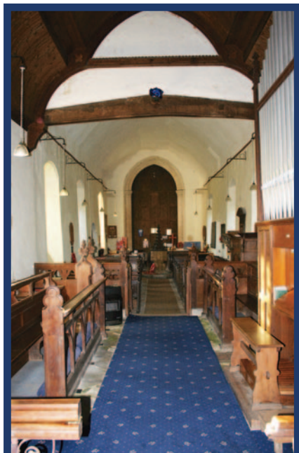
The view towards the bell tower and towards the altar