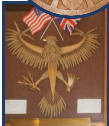
The Corn Dolly and Plaque