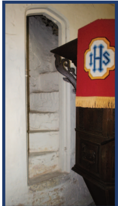
The pulpit and entrance to the rood-loft staircase

The pulpit is a great treasure of the church and is a beautiful piece of 17th century woodcarving, with the characteristic patterns and blank arches, scrolls supporting the book-rest and a ram (maybe put here later) carved in the panel facing west. This was once a two-decker pulpit and the lower deck (at floor level) is also sumptuously carved. Here we see (facing south) the date of the work “NOVE 29th 1631”. The panel with the date on it was (according to Davy’s notes) part of the back-board which was fixed to the wall behind the pulpit and supported its former sounding-board which was gilded and juttod