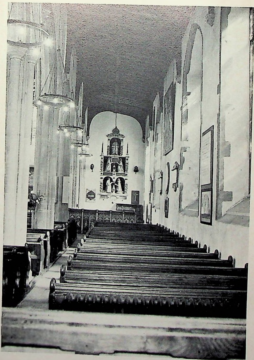
South Aisle and Pitman Memorial.