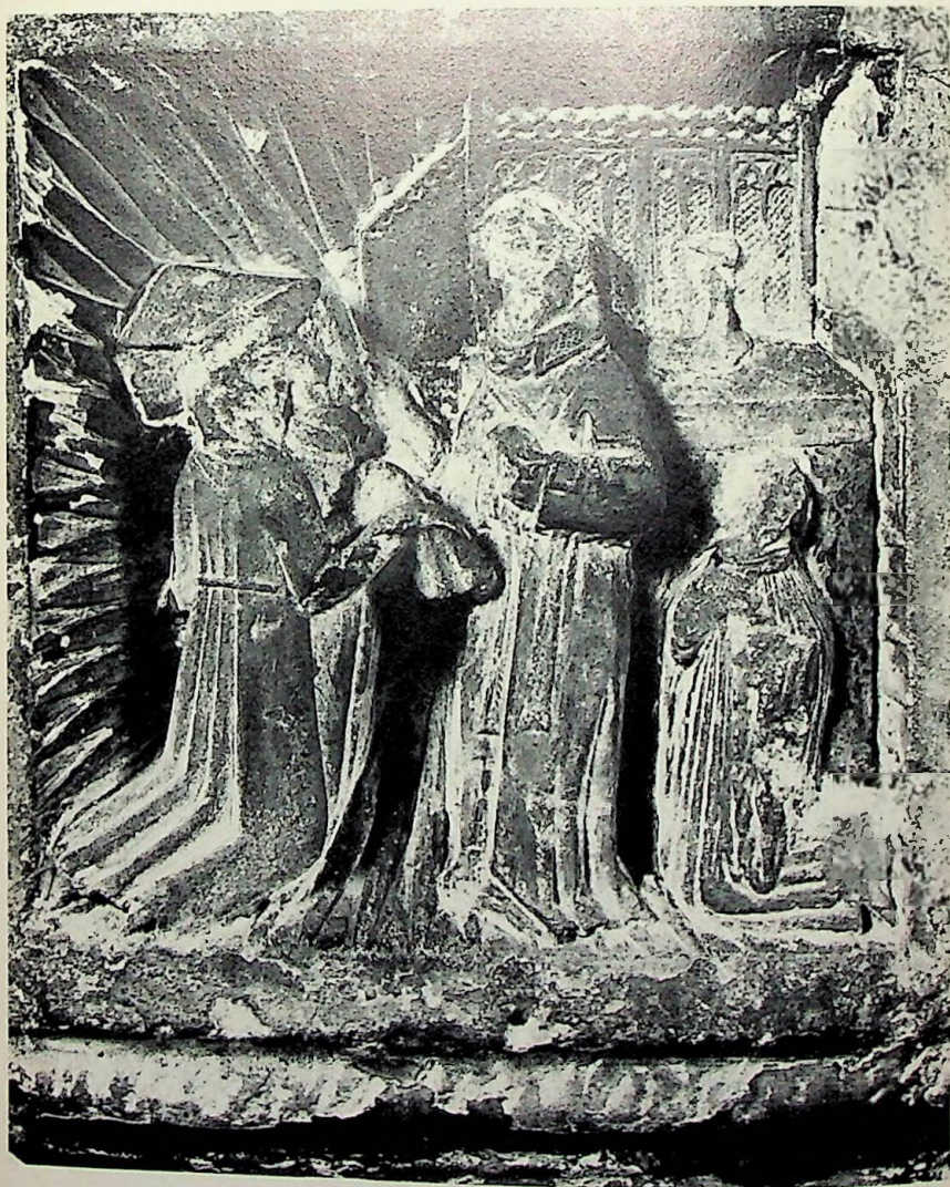
Font panel (Holy Communion).