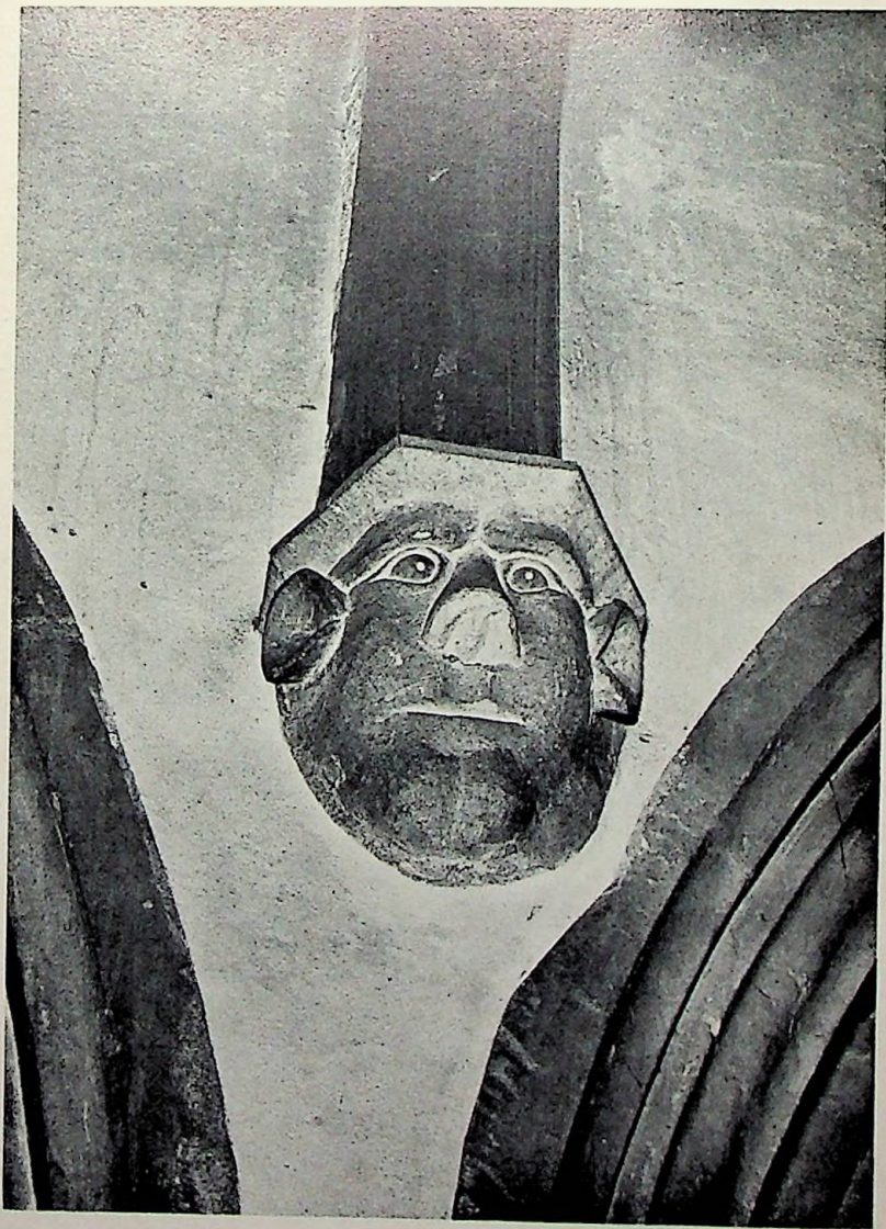
South Aisle Corbel.

The dominance of the locality is best appreciated perhaps when viewed from the river Deben, from the elevated ground of Broom Heath or when approaching the town by rail. Understandably then, during the Napoleonic invasion threat between 1803-1805, a barrel of tar with combustibles was kept at the top of the tower ready to warn of a French attack.