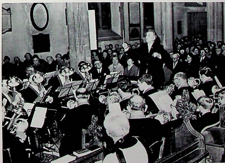
Woodbridge Excelsior Band.