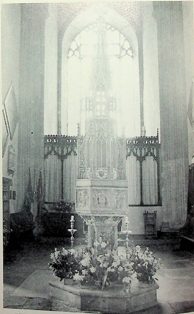
The font, defaced by the Puritans in 1644. The canopy is modern.

trovetry occurred during the construction work of 1813. A door was cut through the outer wall of the church to create easier access to the galleries by a staircase. The churchwardens arbitrarily declared a rate of 2/- in the Pound only to meet the expense, but this was reduced to 1/- only after an ecclesiastical court case. The churchwardens were compelled to pay the excess from their own pockets.