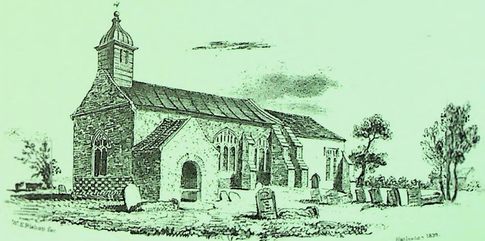
The Church of Denham St John near Eye, Suffolk